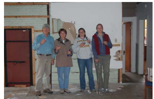
AARCH staff on day one—removing late 20th century alterations to the interior of the building. Note the vault (left) that was revealed behind a partition.