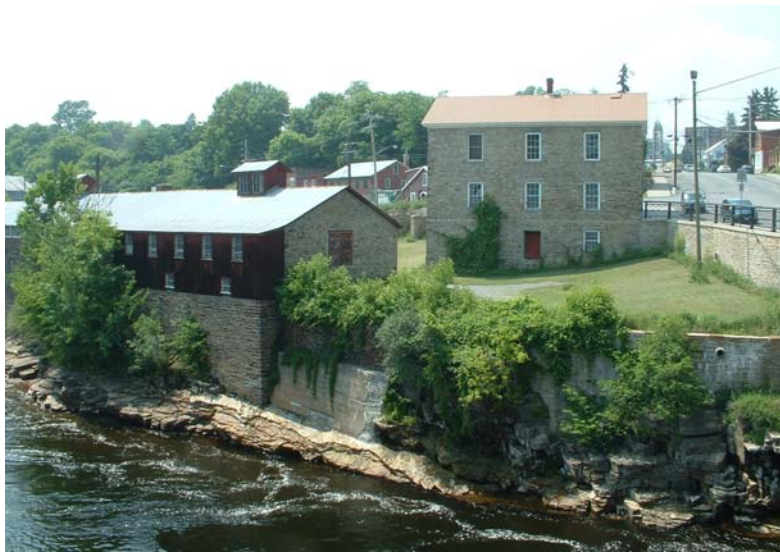
The complex includes the Stone Mill (left) and the Stone Office Building (right), built circa 1850 of local sandstone. The Stone Mill is among the last surviving water-powered industrial buildings in the region. Both are on the National Register of Historic Places.