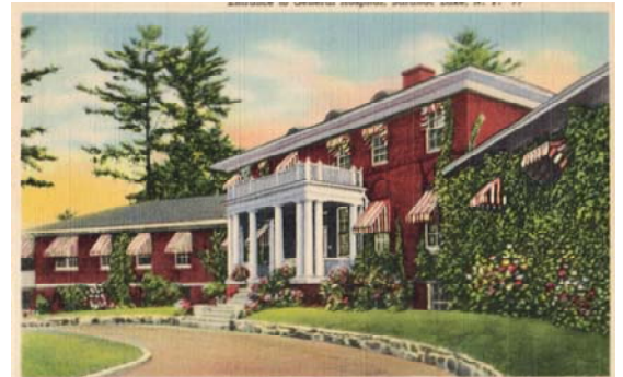
The most recent master plan for NCCC calls for preserving and rehabilitating Hodson Hall. This was originally built in 1913 as the General Hospital of Saranac Lake.

In addition, AARCH worked with the Arto Monaco Historical Society to preserve the Castle at the Land of Makebelieve ; co-wrote a federal grant application to rehabilitate the 1878 Upper Bridge in Keeseville; advocated for the adaptive reuse of the Essex County Jail in Elizabethtown; and spoke out, with many others, for the preservation of Hodson Hall at the North Country Community College campus in Saranac Lake. The fate of the fire observation towers on Hurricane and St. Regis mountains awaits the completion of a region-wide fire tower plan by NYSDEC. The future of other historic structures within the Forest Preserve, such as Debar Pond Lodge in Duane, the railroad station at Nehasene , and ruins associated with Great Camp Sagamore will hinge on how they are treated by unit management plans currently under development by DEC.