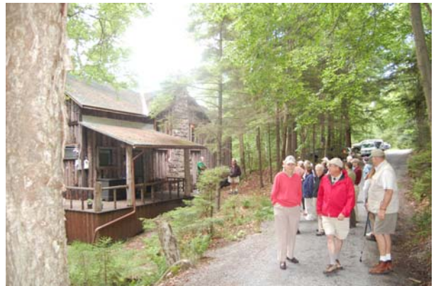
Tour participants explore one of the cottages on Crag Point as part of our Rustic Architecture of Big Moose Lake outing.

This year AARCH sponsored thirty public educational tours throughout the region. These explored a wide variety of places and were extremely popular with our members and the general public. We offered two workshops, including "What Style Is It?" in Schroon Lake and a cemetery preservation workshop in Elizabethtown. We also gave twenty public tours of White Pine Camp, the 1926 summer White House of Calvin Coolidge, did more than a dozen public lectures, and held three special events - our annual meeting at the Grange Hall in Keeseville, a benefit event at Camp Uncas, and an awards luncheon at The Hedges on Blue Mountain Lake. These outings continue to be among our most popular and recognizable activities and, over the last seventeen years, we have cumulatively offered more than 500 outings to more than eighty-five different places, which were attended by more than 11,000 people.