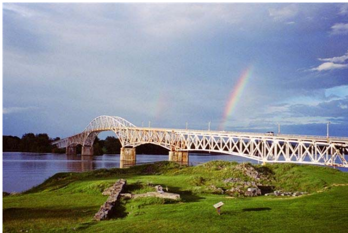
Lake Champlain Bridge.

We have learned several important lessons through all of this. First, we learned how passionate our members and friends are about this place, in particular, and the region’s architectural heritage, in general, and this is great news. Dozens of people wrote to the new owners, to town and Adirondack Park Agency officials, and wrote editorials, letters to the editor, and even blogged about it. This was an unprecedented show of support for the preservation of a privately owned property. Second, we’ve realized that, as an organization, we need to do more to educate local municipalities about what tools they could have available to them to prevent, or at least slow down, this kind of thing from happening again. We are committed to doing this through an even greater public education and training and advocacy effort. This would also not have happened had the property been protected by a preservation and conservation easement. The loss of The Wawbeek demonstrates how important these voluntary agreements are as a preservation tool. AARCH already holds four preservation easements and will actively work in the future to secure more of these.