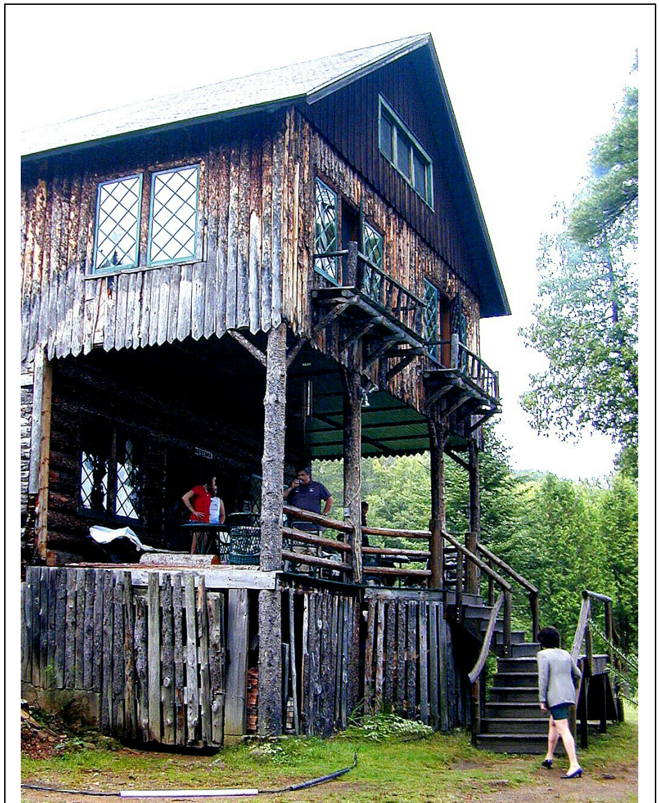
A guest approaches the front porch of Camp Solitude’s Main House.