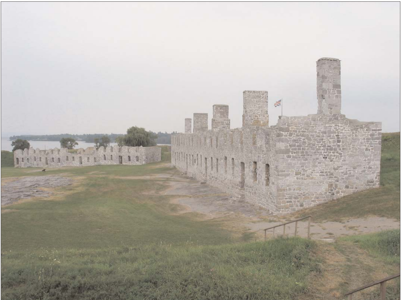
Exterior of the ruined British barracks at Crown Point, chimneys still standing tall.

The French first established a presence at Chimney Point, Vermont, across from Crown Point, in 1731, effectively controlling passage up and down Lake Champlain and giving the French a base for raids on English positions throughout the region. The first 30-man French fortification, at Chimney Point, was called Fort de Pieux. With that built, the area was suf-