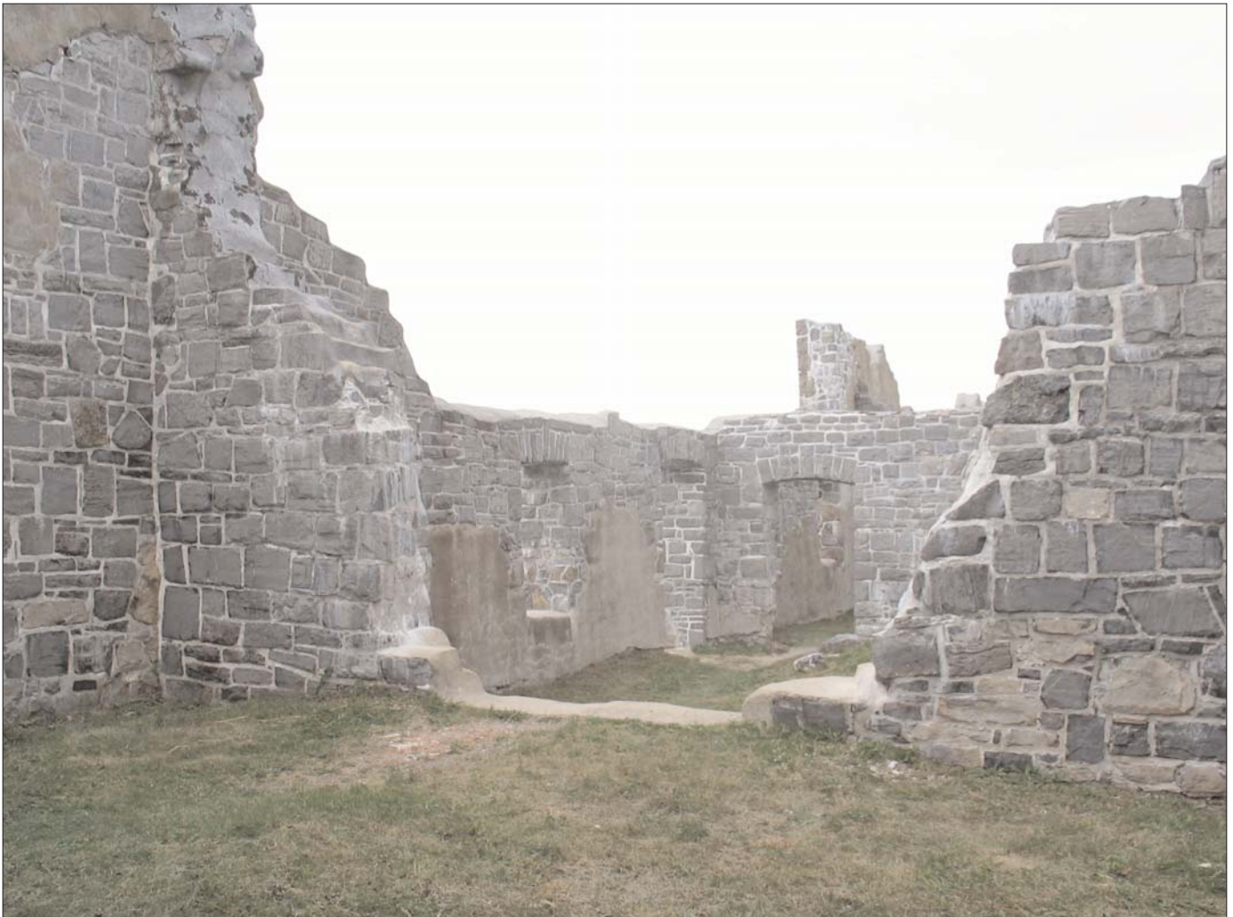
An interior view of ruined British officers' barracks, open to the sky.

During the summer, an average week brings between 2,200 and 2,800 visitors to the site. To visit Crown Point without the crowds, come in May, June, September or October. Plan about an hour and a half for your visit.