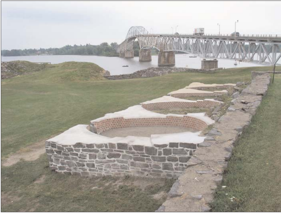
Behind the reconstructed remains of the French fortress's foundations, the modern Champlain Bridge crosses the strait between Crown Point, New York, and Chimney Point, Vermont.