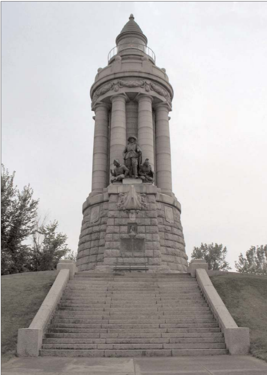
The Champlain Memorial Lighthouse at Crown Point, as seen going up the steps from the old D&H Railroad docks on the lake.

Besides the lighthouse tower itself, two other works of art are part of the Champlain Memorial site. One is a small bronze bust, titled "La