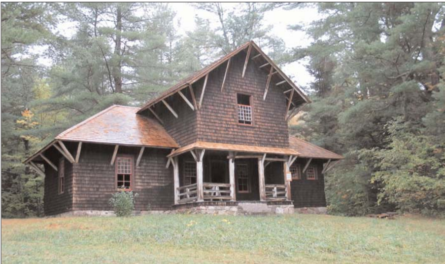
Three of the five buildings comprising the Santanoni Farm Complex (top to bottom): the cow barn, the creamery, and the gardener's cottage.