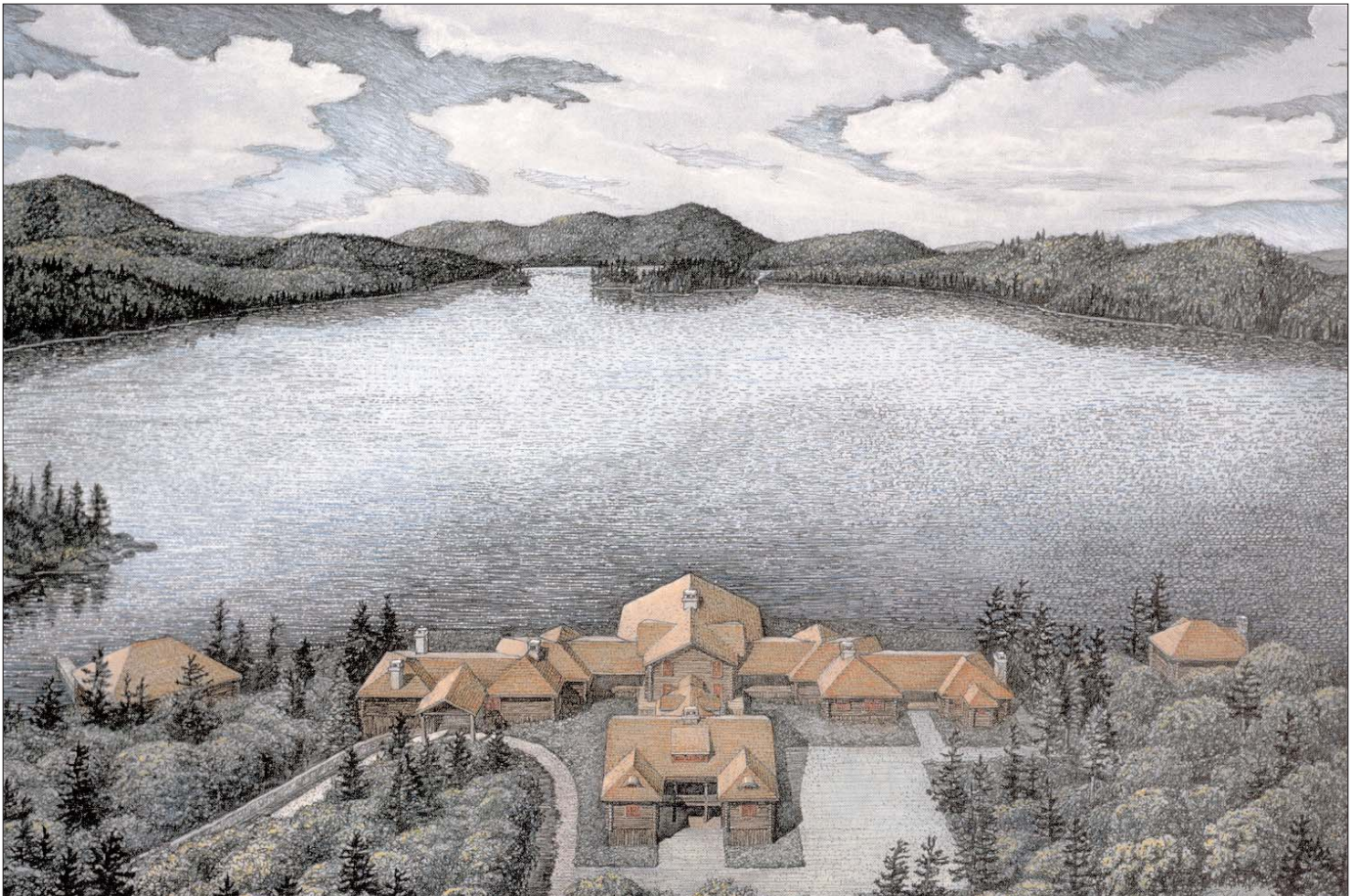
Paul Malo painted this watercolor from architectural drawings to show the Japanese "ho-o-den" form of the Main Lodge at Camp Santanoni, stretched out like a phoenix on the shore, poised to take wing over Newcomb Lake.

Camp Santanoni stayed in the Pruyn family for many years, serving as a retreat for guests like then-Governor Teddy Roosevelt. Pruyn