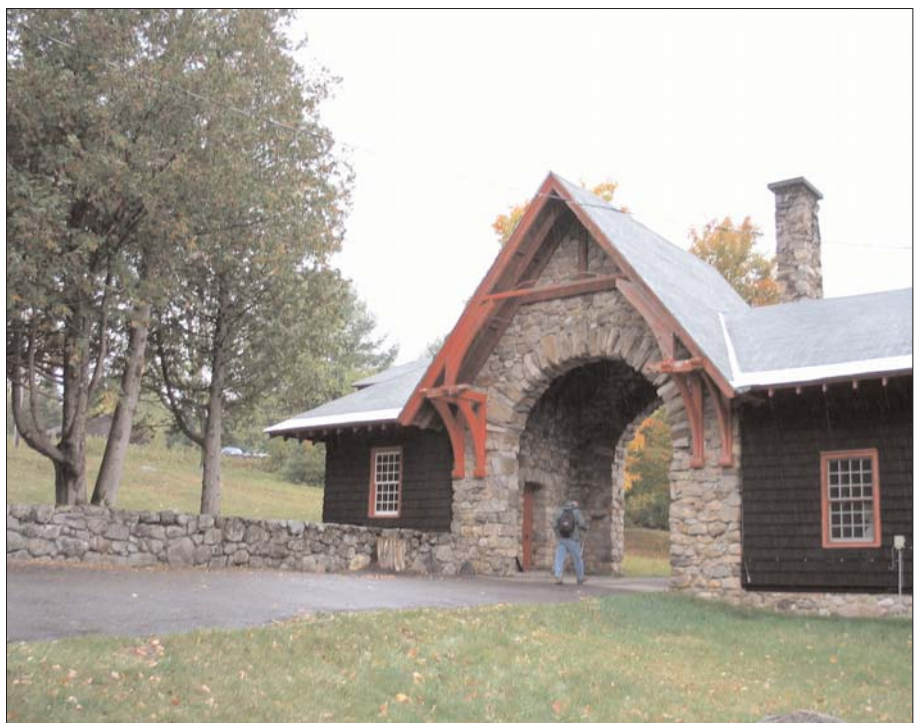
The Gate Lodge.

The walk up the main carriage road through the Santanoni Preserve was a particularly lovely one, even in the early October chill of a light rain. Soon, however, the woods lining either side of the road opened up, and before us stood the core of Bertie Pruyn's experimental farm complex: a large, shingled, three-level barn to