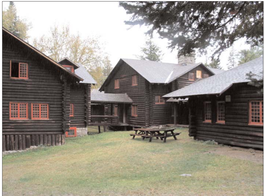
A portion of the Main Lodge complex of cabins, joined by a network of porches.

AARCH was formed in 1990 to promote better understanding, appreciation and stewardship of the unique architectural heritage of the Adirondacks through education, action and advocacy. With offices in the Keeseville Civic Center at 1790 Main St., its telephone number is (518) 834-9328, and its Web site address is www.aarch.org .