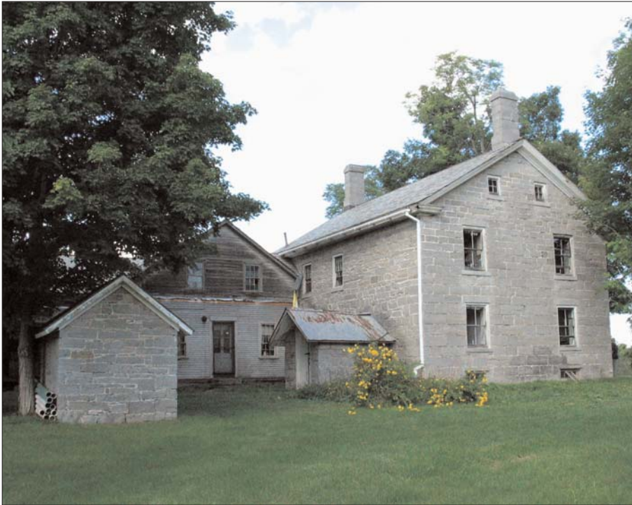
Old Elm, seen from the south: Original one-and-a-half story frame house, center; left, back of stone icehouse; right, "new" two-story stone house.

Topsy," starting with a small central structure built in the early 19th century to which was added extension after extension. Separate staircases climb from Scragwood's ground floor to the dormered attic bedrooms in each section of the house, with tiny crawlway doors linking the segments upstairs.