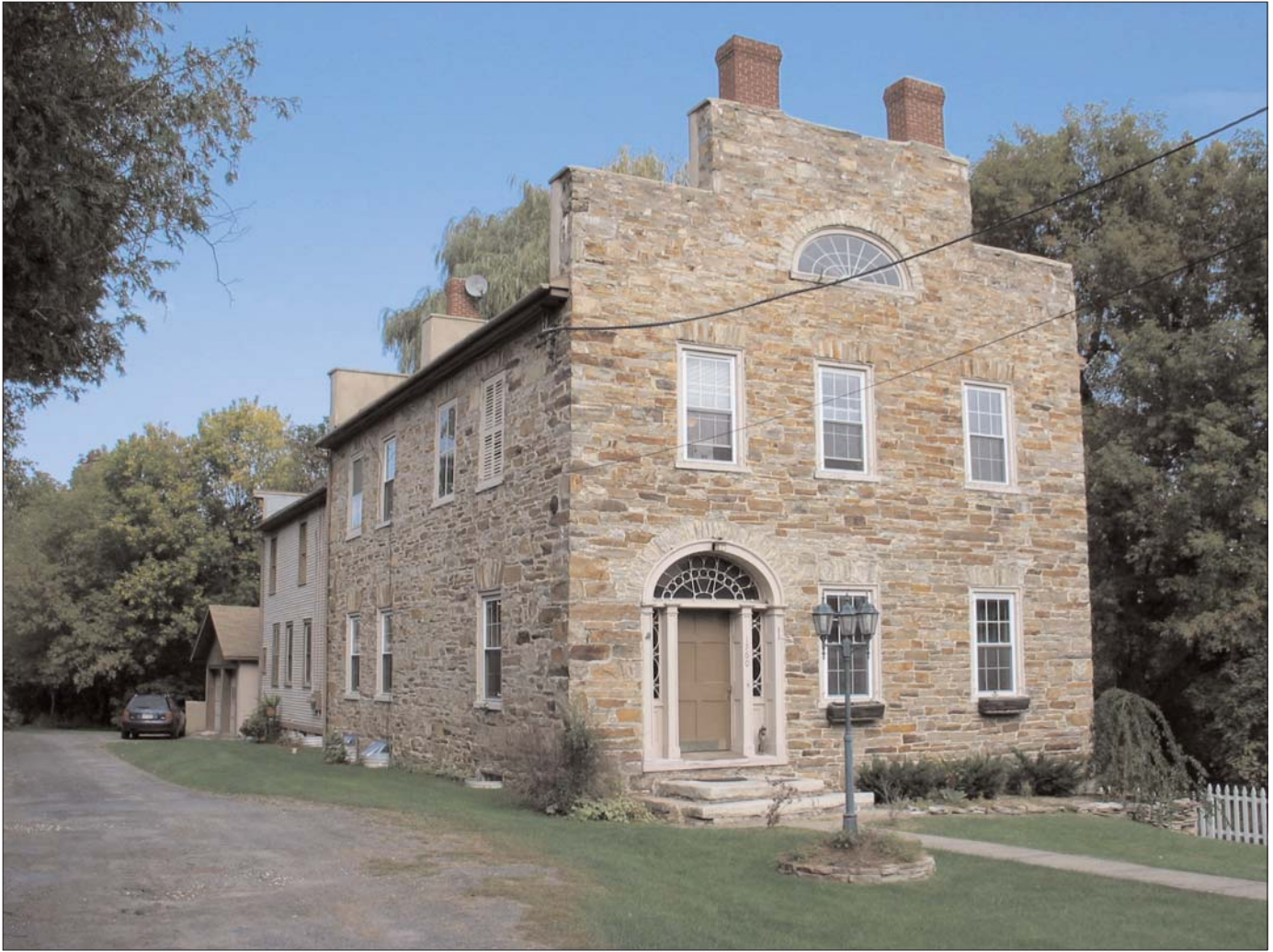
The Richard Keese II House, 1760 Main, ca. 1823.

wind-up, counterweighted clock in the Presbyterian church's belfry still works, and it is wound and set regularly.