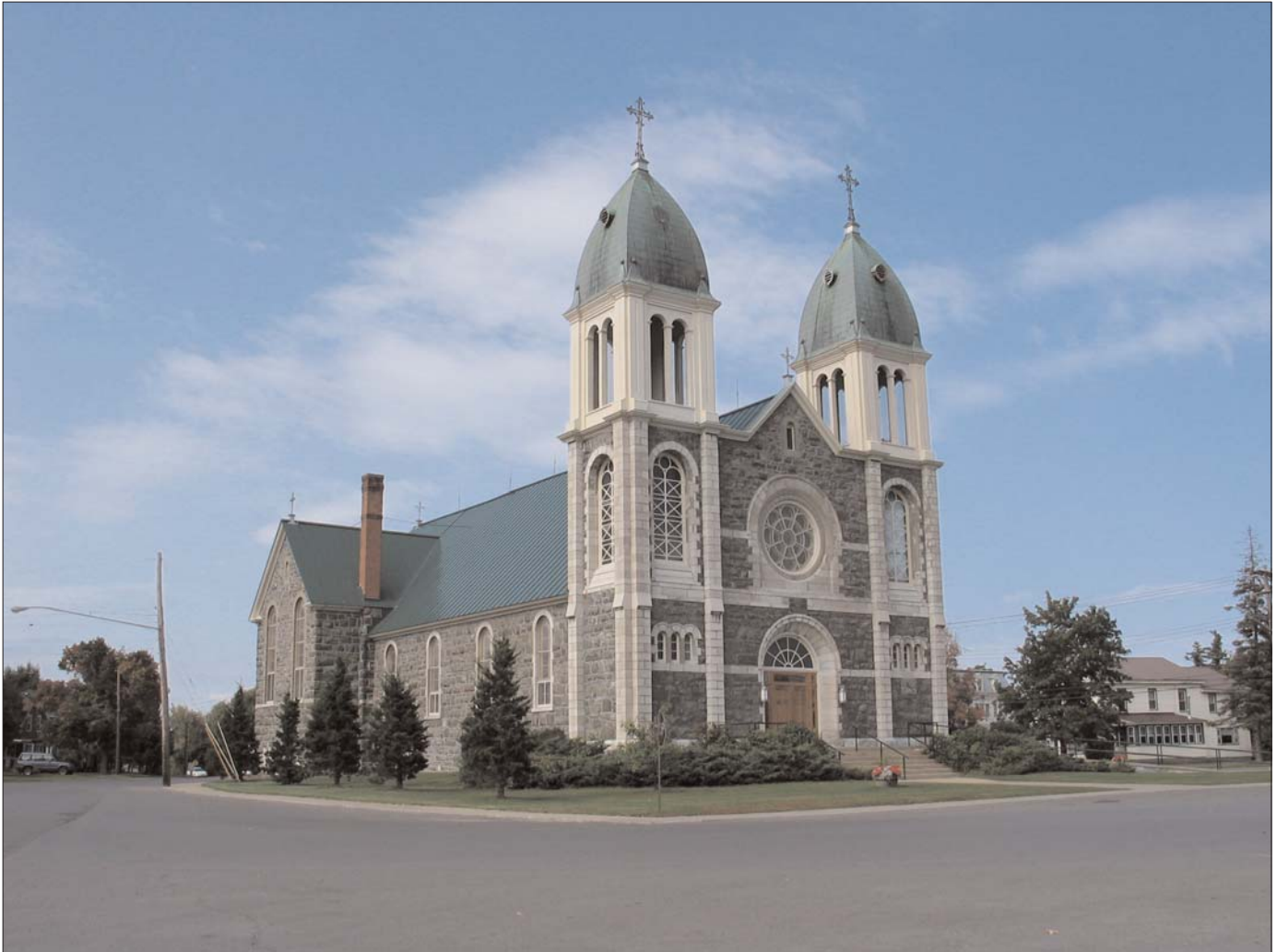
St. John the Baptist Catholic Church, built in 1903.

oldest surviving schoolhouse. Built around 1850, it had two rooms: one for the boys, the other for the girls.