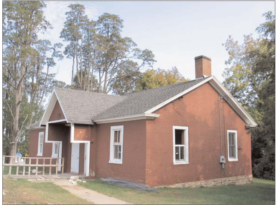
The earliest of Keeseville's surviving schoolhouses, District School No. 8, ca. 1850.

On the southeast was the company’s shipping office, built around 1856, which later became home to the Au Sable Valley Grange (1903). On the southwest corner the company built its headquarters around 1852, adjacent to