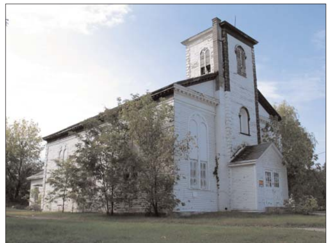
At left, Keeseville's first Baptist church, built in 1825, on its original site — the place where St. John's Catholic Church was built in 1903. At right, the Baptist church building today, thought to be the second-oldest surviving church building in the Adirondacks.