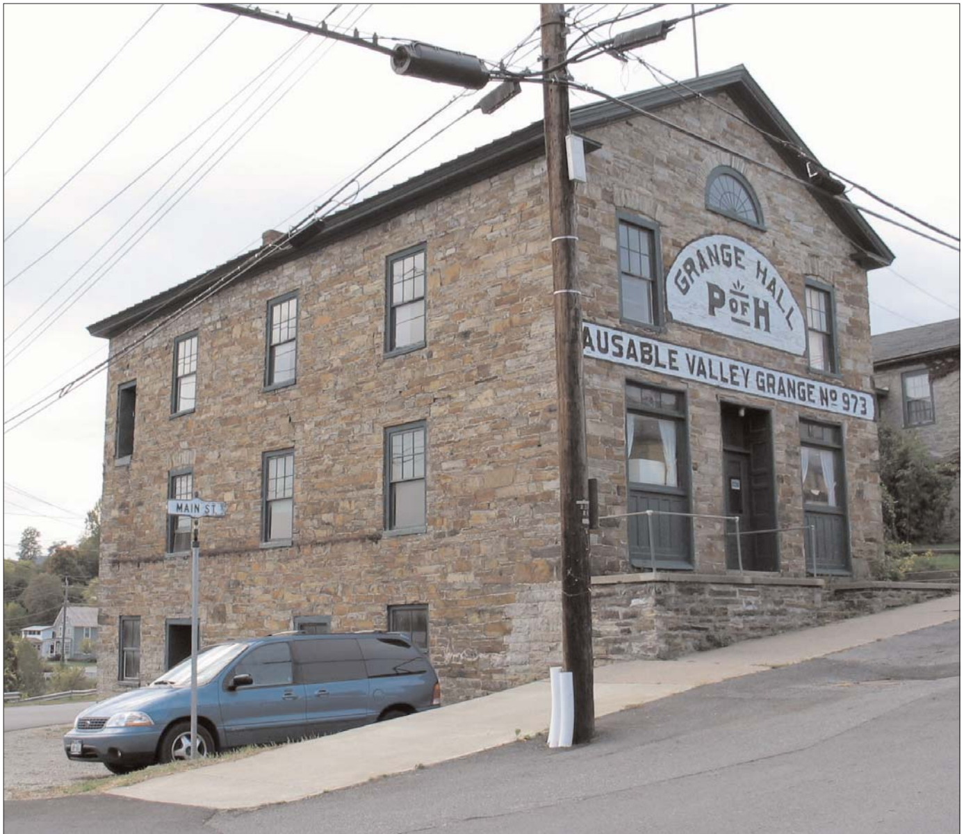
Au Sable Horse Nail Company headquarters, 1747 Main, ca. 1852.

The Swinging Bridge — Going down Clinton Street toward the Au Sable River, we came to the second