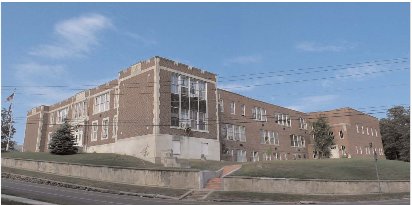
Keeseville Central School, built in 1936, was the third public school built on its Academy Hill site.