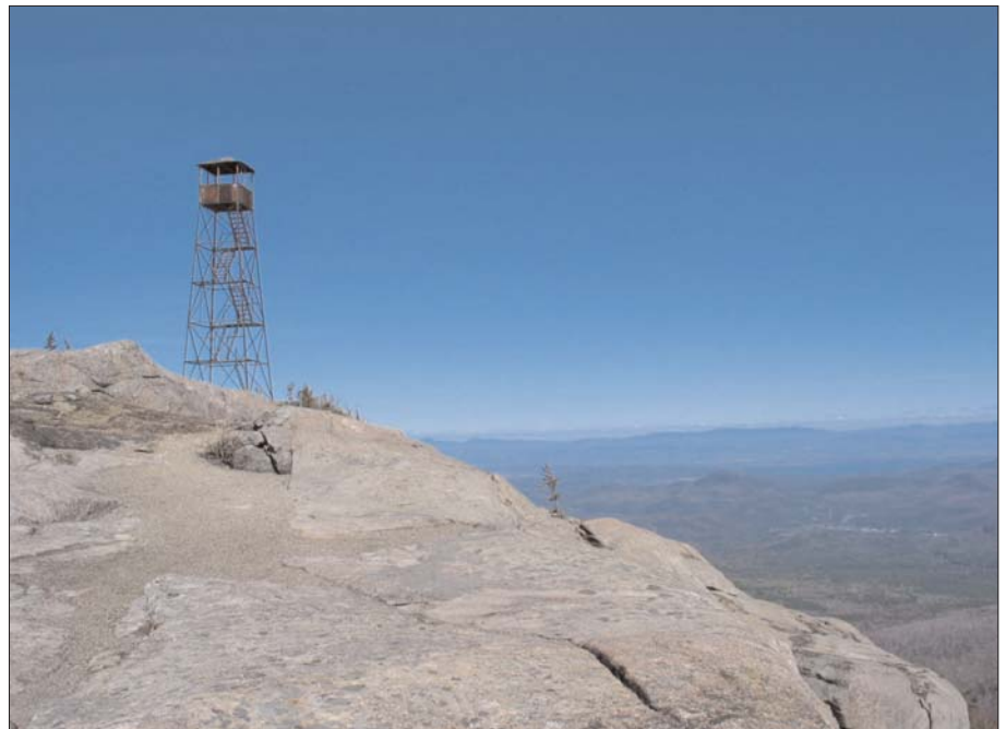
Abandoned fire tower atop Hurricane Mountain.

I picked a late January day to start my first climb toward Hurricane’s summit, beginning at