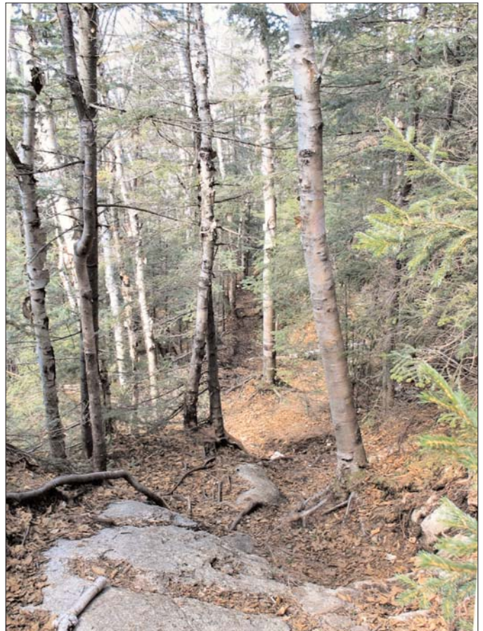
This shot, looking back down the North Trail, is the point where our reporter had to give up his second attempt to summit Hurricane. At left is how it looked in February; at right, in May.