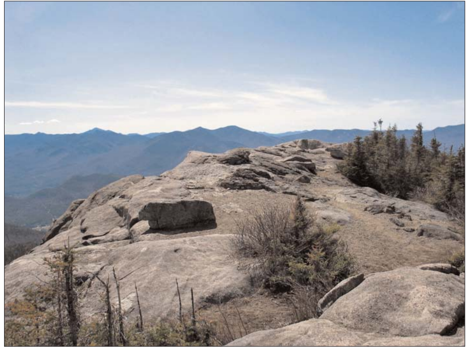
The summit of Hurricane Mountain.

Like so many places in the Adirondacks, the North Trail up Hurricane Mountain seems like an altogether different place after the snow is gone. When the path really starts climbing, it climbs — and not up a soft-soiled trail, either, but hopping from rock to boulder to protruding root of tree. Though the snow brought its own challenges to