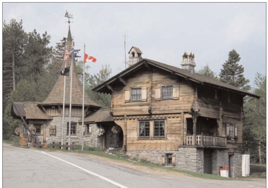
The chalet-style tollhouse at the highway's entrance.

The prospect of constructing a new road through the Wilmington Wild Forest split the membership of the Adirondack Mountain Club and was opposed by other leading