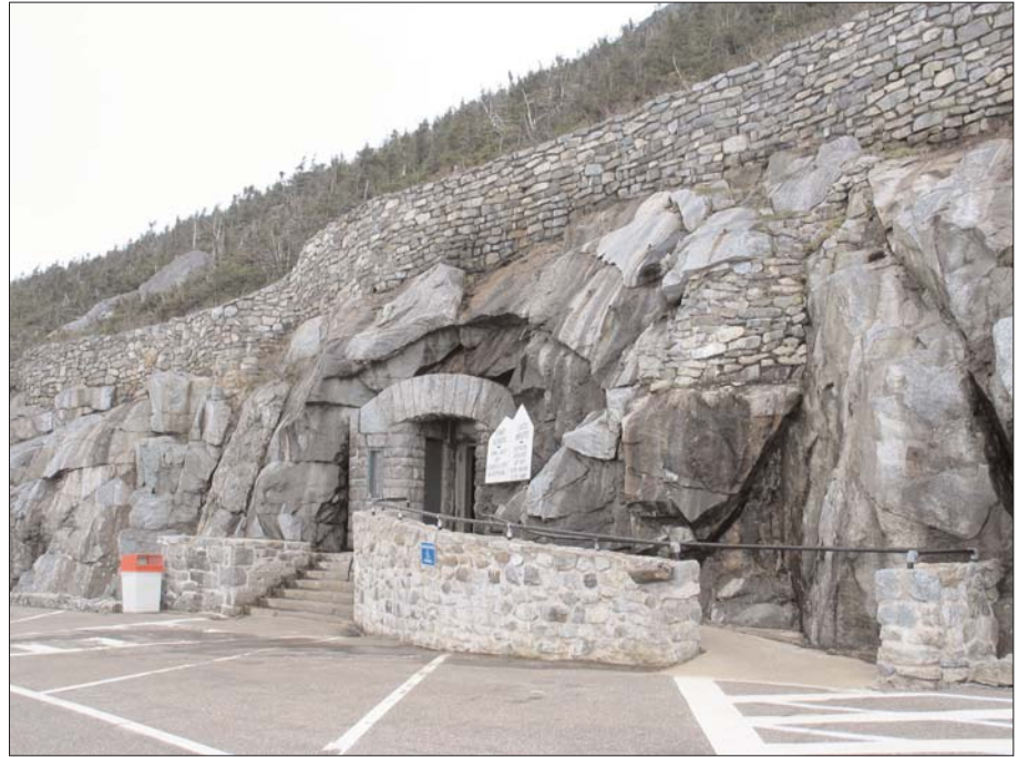
The entrance to the tunnel leading to the elevator that takes Whiteface visitors to the mountain's summit.

The drive up the Veterans Memorial Highway takes visitors