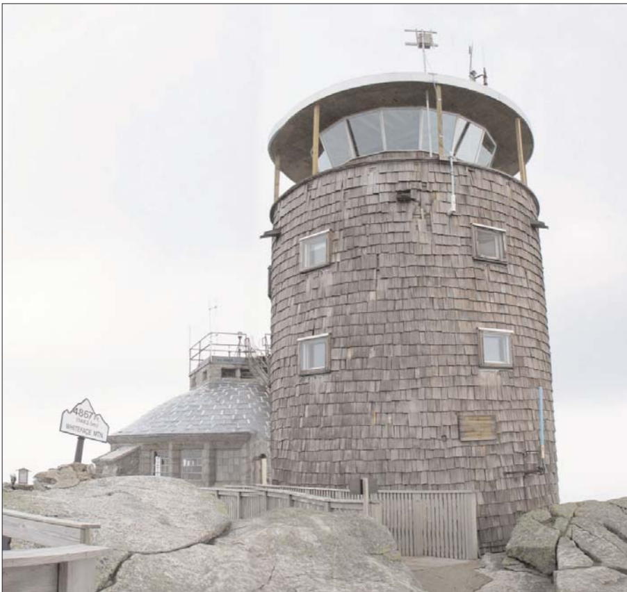
The cylindrical weather observatory and the Summit House behind it are often mistaken from a distance for the famous Whiteface Castle, built a bit lower on the mountaintop.

While the other High Peaks are all grouped together, Whiteface rises alone. Nothing close by is anywhere near its height, giving visitors a viewing experience they can't get on any other mountaintop in the Adirondacks. Add to that the facts that you can motor up Whiteface and ride in an elevator to the summit, and you begin