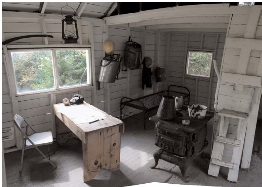
Above, a composite shot of the Goodnow Mountain fire observer's cabin interior.

A little bit past the little barn is a side trail leading to the ruins of a covered well that once provided drinking