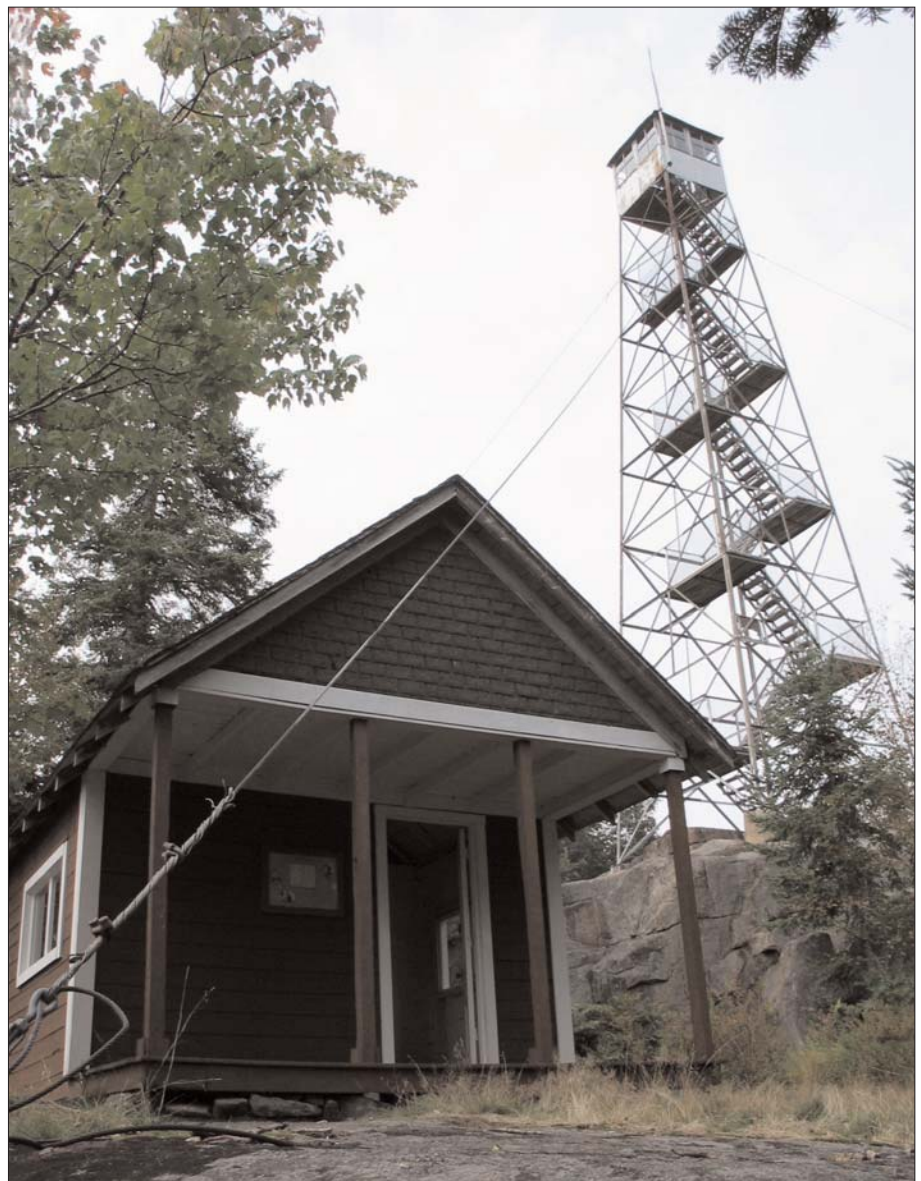
Fire observer's cabin and tower at the summit of Goodnow Mountain.