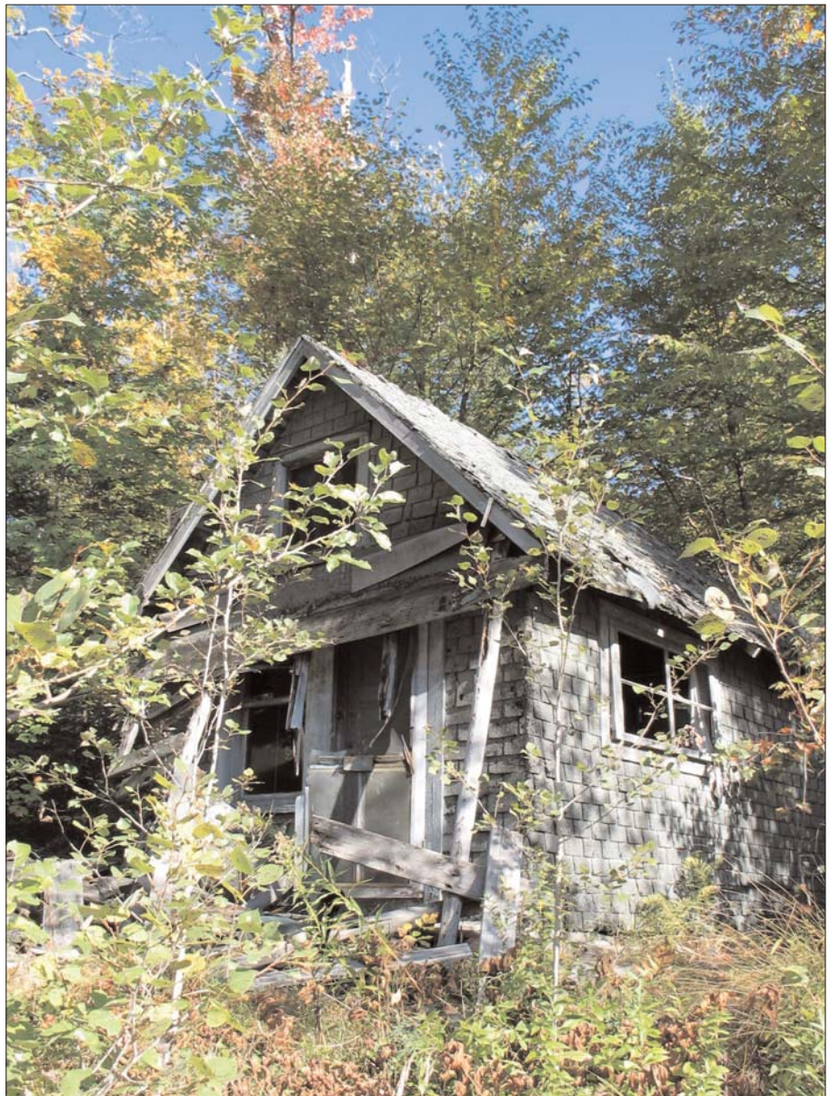
The Model 1922 fire observer’s cabin at the base of Mount Adams.

THE SECOND part of the trail, which starts when you leave the observer’s cabins, is where the improvements made over the last