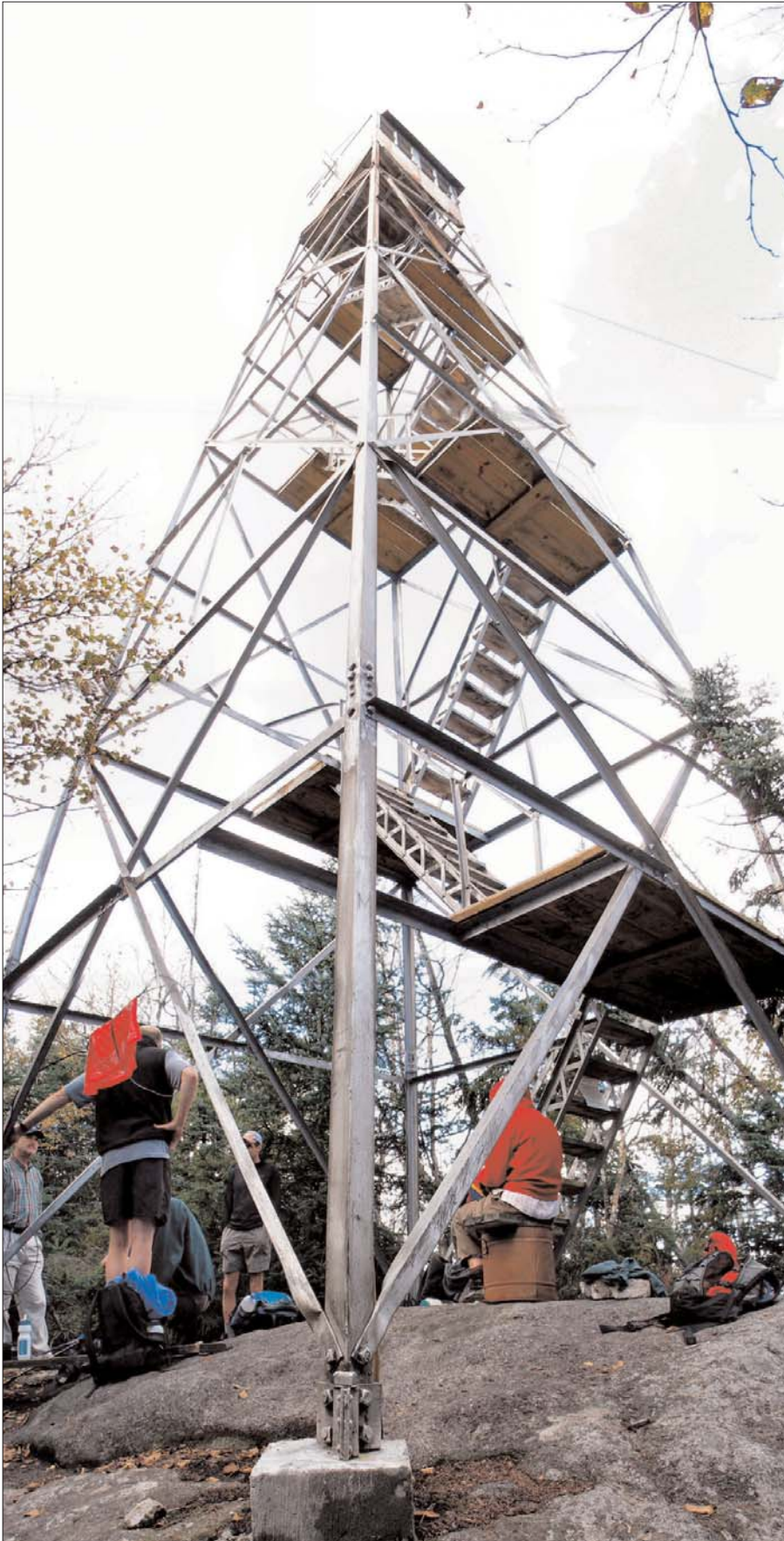
A close shot up the interior of the fire tower's steel frame, featuring the new steps and platforms

One is a pair of good, solid, lug-soled hiking boots — and by that, I definitely do not mean a pair of cheap shoes from Wal-Mart designed to look like hiking boots.