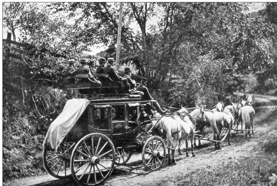
MARY MacKENZIE HISTORIC SLIDE COLLECTION