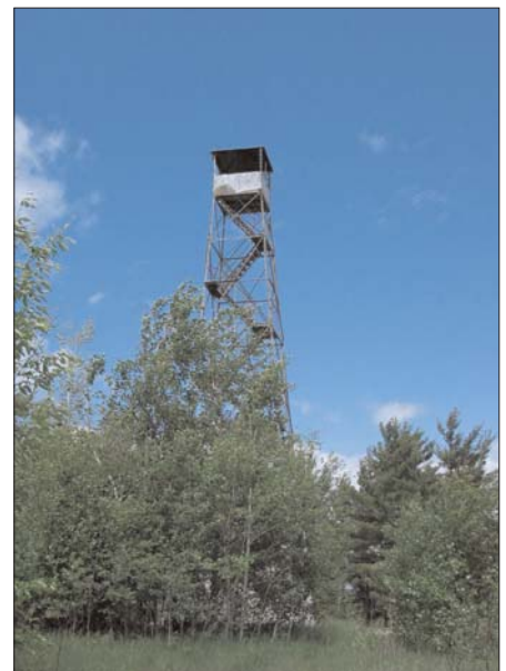
Restoration: Three images from a trip taken in the summer of 2004 show the Palmer Hill fire tower's appearance after the phone lines and antennae are "photoshopped" away, leaving the tower looking much as it did when fire observers of yore kept watch over the Adirondack Forest Preserve from the tower's cab.