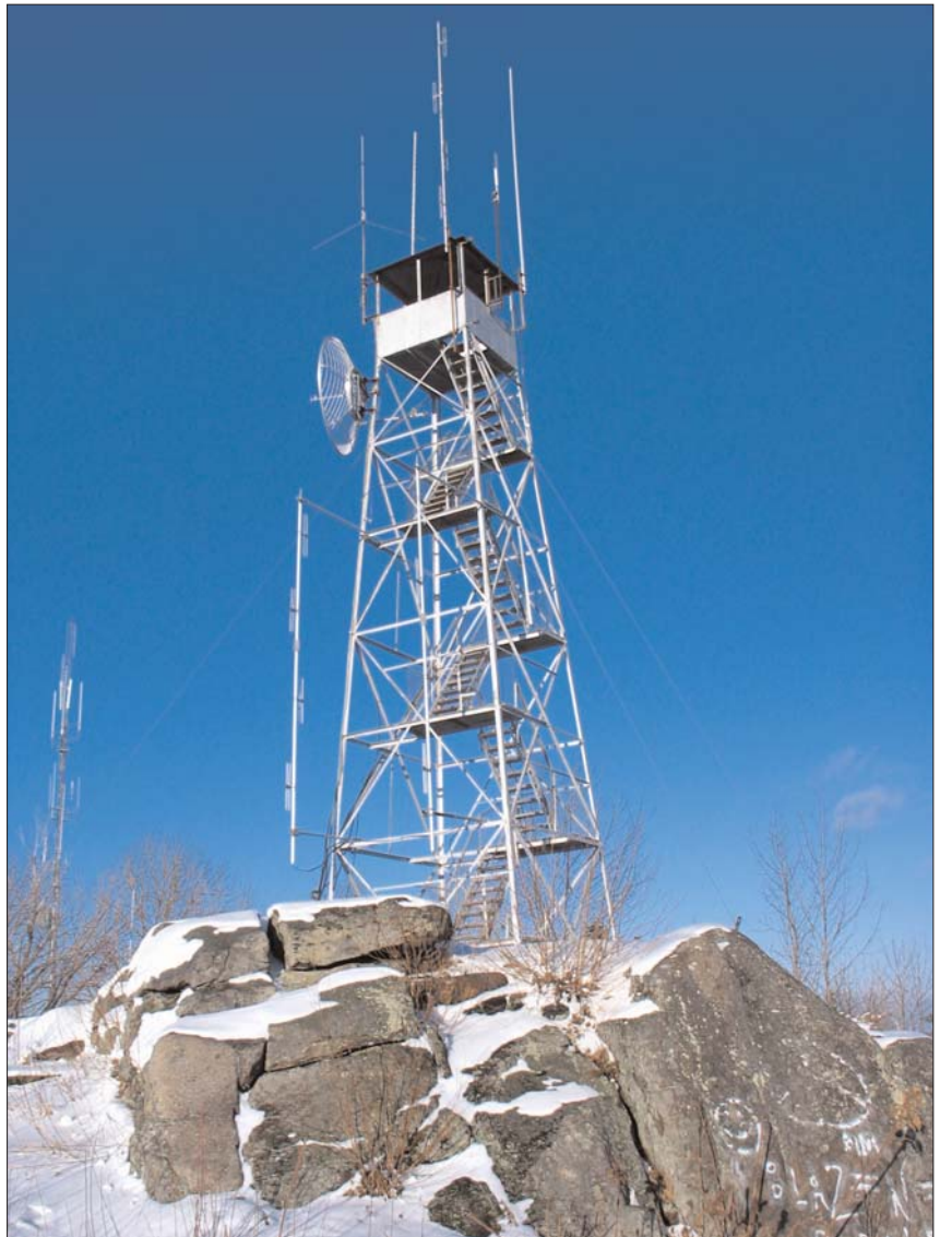
LEFT, the fire tower on Palmer Hill. RIGHT, the tower on Belfry Mountain.