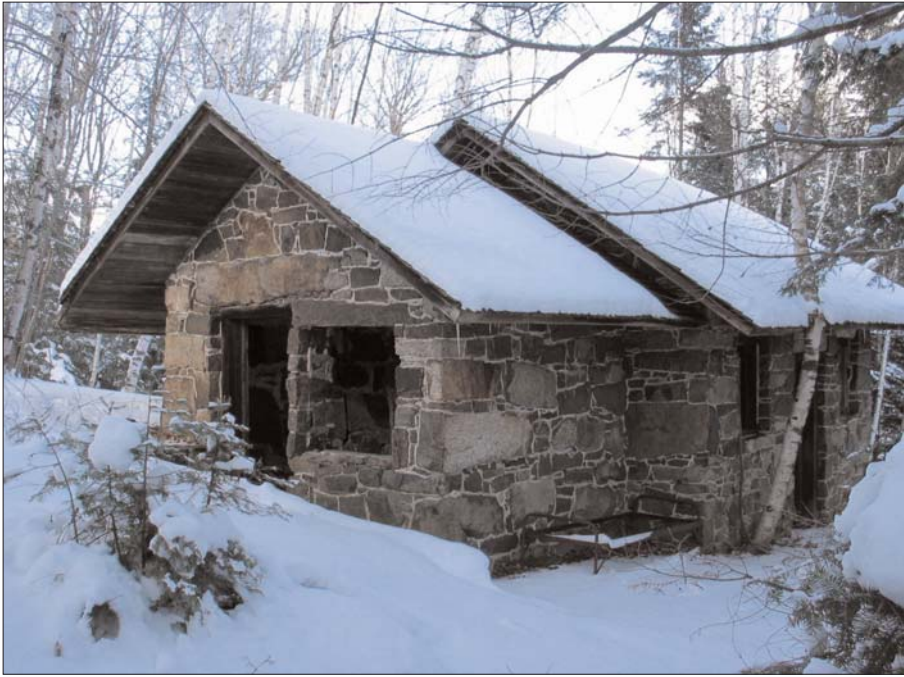
The ruin of a small stone cottage is the only structure still standing at Camp Birchwood, on Whiteface Bay, built in 1910. The camp was acquired by the state in the 1960s — and torched.

Undercliff. By virtue of its location, Undercliff has nearly unobstructed views of both Whiteface Mountain to the northeast and the High Peaks to the southeast.