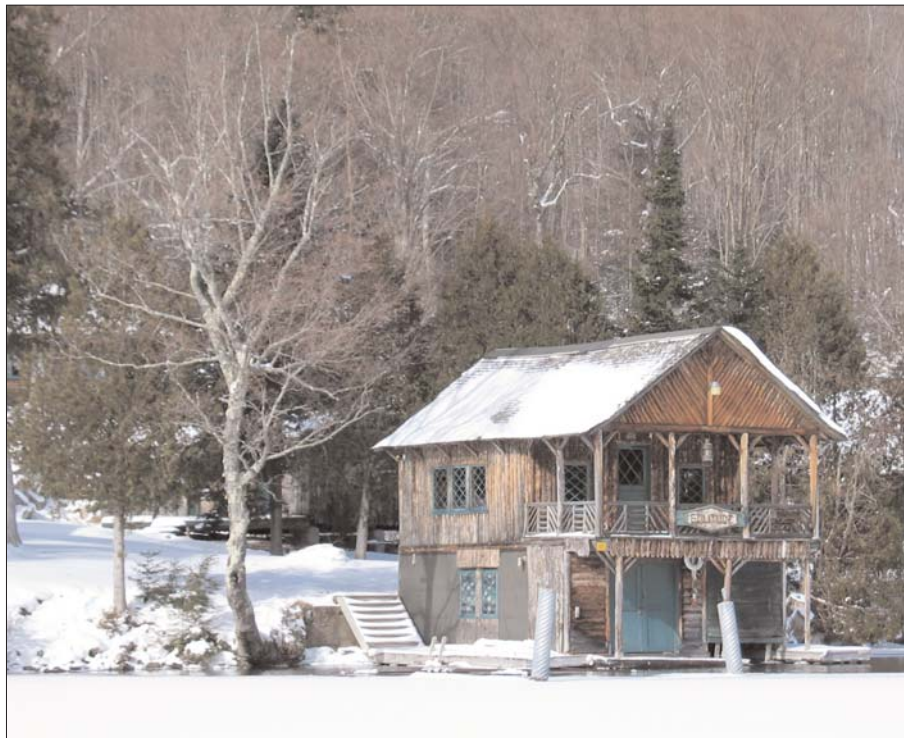
The Camp Solitude boathouse. Previously named Camp Grenwolde, Solitude is a beautiful, well-preserved example of the Big Lake camps of a hundred years ago.

In 1872, just below the mouth of Minnow Brook, a well-known