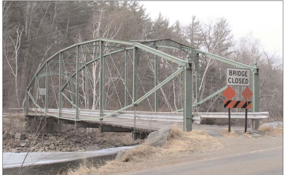
The Walton Bridge, Keene, with its lenticular (lens-shaped) truss

Originally spanning Black Brook in the Clinton County hamlet of the same name from 1890 to 1925, the Walton Bridge was purchased by Essex County to