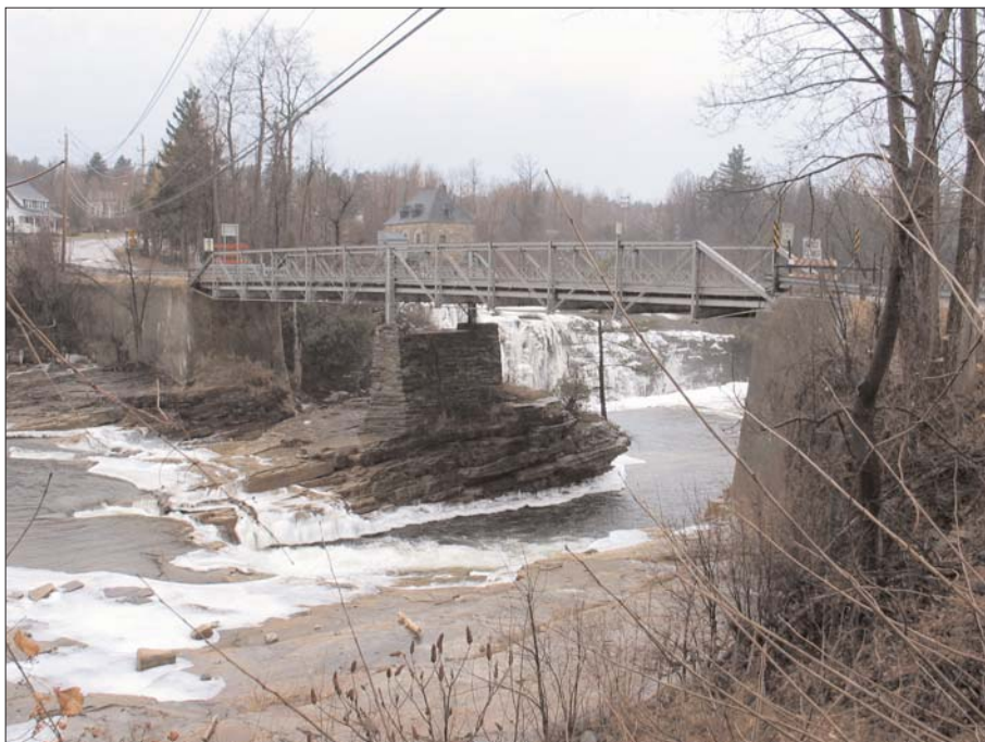
Bridging the Au Sable River between the Rainbow and Alice falls in the hamlet of Au Sable Chasm, this ca. 1890 iron bridge was closed in 2004 after a DOT inspection.

The original wooden bridge, built in the 1840s, consisted of four connected spans, their junc-