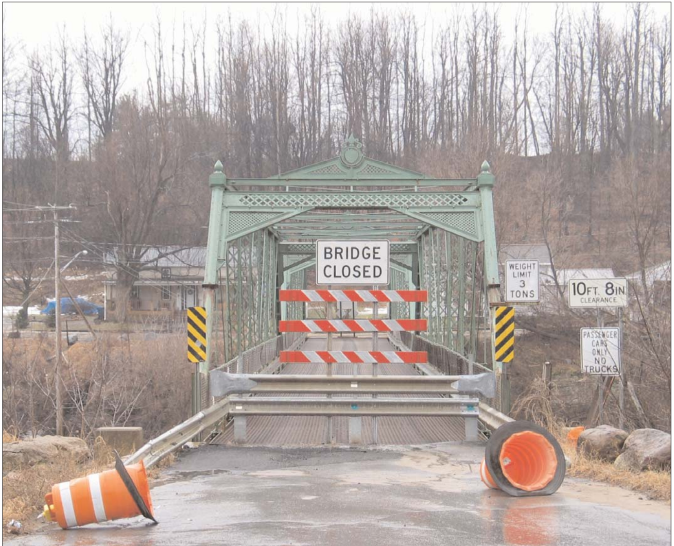
Keeseville's historic Upper Bridge, built in 1888, was closed last year by the state DOT following a routine inspection.

"Our conversations have been about how to bring the Old State Road and Upper bridges back on line," Engelhart said. "The Walton Road, on the other hand, really works well as a foot bridge — but it does require maintenance."