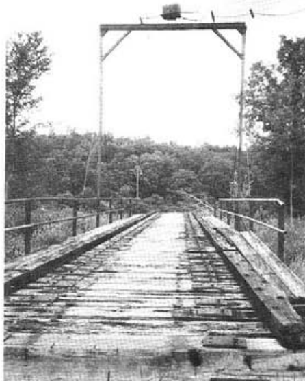
Railroad turntable at North Creek