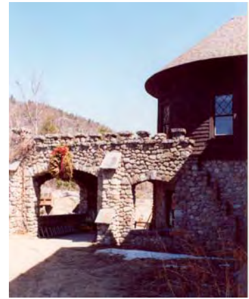
View of the porte-cochere at Wellscroft

The roof is moderately pitched, has three projecting cross gables, and is pierced by three gabled dormers, four massive brick chimneys, and a short service elevator tower. The gables and dormers are finished with either wood shingles or decorative half timbering (wood and stucco). The third floor area is lit by an assortment of casement windows, all of which have diamond-paned sash.