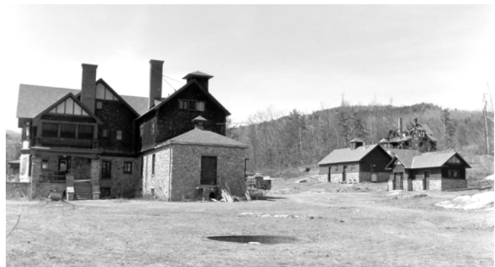
View of Wellscroft, showing (from left to right) cooler on rear of service wing, Power house, fire house, and ruins of caretaker's house in background

The Power House is a one-story, L-shaped, building with a moderately pitched gabled roof, which is punctuated by a chimney and ventilator cap. The lower portion of the building is constructed of native field and cobblestone and the upper portion of the building is wood-framed and faced with wood shingles. The gable area of the building originally had a decorative half-timbered finish (wood and stucco), which has since been removed (plans are to restore it). The fascia of the gable eaves wood shingled. The building has several original exterior wood doors and an assortment of 2/2 double-hung windows.