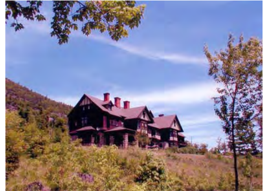
View of the Main House at Wellscroft, showing its setting at the foot of Ebenezer Mountain

Wellscroft is located in Upper Jay (Essex County), New York on 15 acres of land at the base of Ebenezer Mountain and having a commanding view over the AuSable River Valley and the Adirondack Mountains. The original Wellscroft property was about 750 acres in size and included a large amount of wooded and undeveloped acreage on Ebenezer Mountain. Most of the original acreage (735 acres) is owned by the Town of Wilmington.