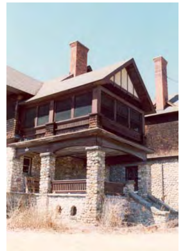
View of sleeping porch