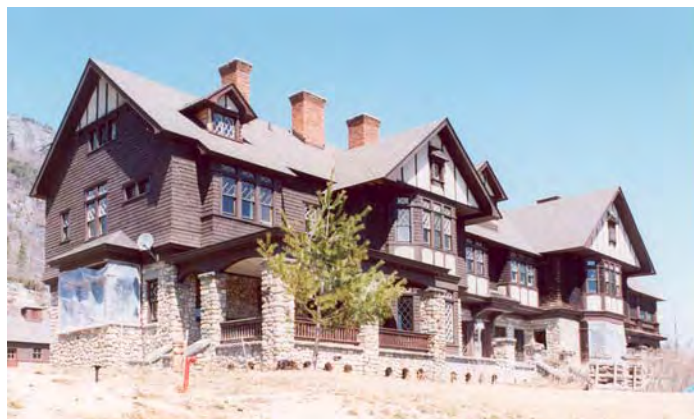
The Main House at Wellscroft in Upper Jay, New York

Built in 1903, at a cost of $500,000, Wellscroft was among the largest country estates built in Essex County at the time. It was designed as a large, self-contained summer retreat, which included the 15,000 square foot main house, a caretaker's house, children's playhouse, firehouse, powerhouse, carriage house, and its own water supply, fire protection system and power plant, gardens and landscaping, and private roads and trails.