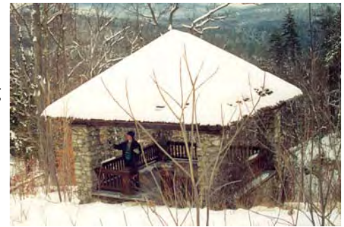
Wellscroft Gazebo, showing exterior features

The Ice House is a small one and one-half story building with a moderately pitched gabled roof. The lower portion of the building is constructed of native cobblestone and the upper portion of the building is wood-framed and faced with wood shingles. The building has two exterior wood doors and a few wood double-hung windows.