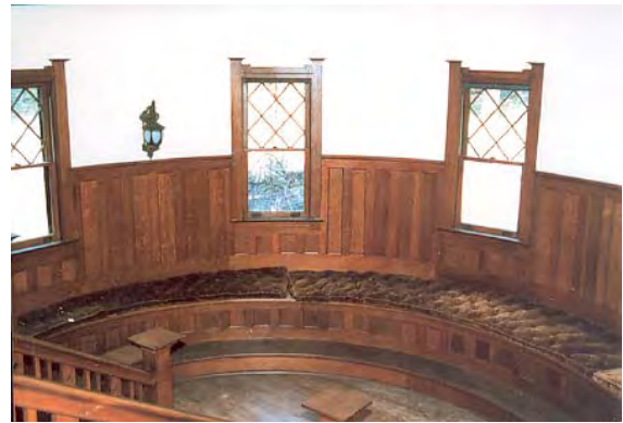
View of stairway landing, showing built-in window seat, wainscoting, and typical windows

semi-circular shaped entrance hall. In this space are a door to the cellar stairs, a storage closet, and a double doorway to the grand stairway. The stairway fills the large wing, which protrudes from the rear of the building, and which is 25' high, 27' deep, and 18' across. From the entrance hall, you rise up a set of center stairs to a landing and then ascend up either set of stairs, which rise to large semi-circular landing. This landing has a semi-circular window seat and seven double hung windows (diamond-paned above and single paned sash below). The room is rich in wood (oak) elements, including 60" high, vertical panel, wainscoting, stairs and railings, and 2" oak flooring. Above the wainscoting are plaster walls and ceiling. From the landing, a single set of stairs ascends to the second floor landing and central hallway.