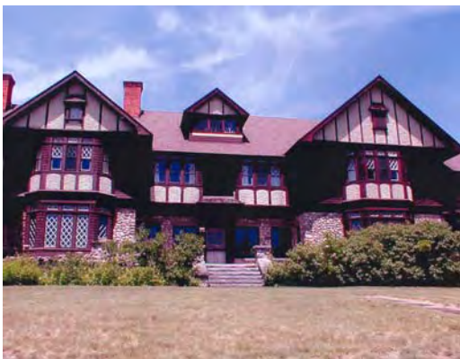
View of the front façade of Wellscroft, showing many of its exterior features.

The main house is a long, rectangular shaped two-story building with several projecting bays and porches, gables and dormers, a porte-cochere, and a service wing. The first story is faced with native fieldstone. This material is also incorporated into the house's porches, as roof supports and railing components, exterior stairs, and in the porte-cochere. The design and construction of this latter feature includes a crenellated parapet, buttresses, and low broad arches. Quarried local granite (anorthosite) is used for door and window lintels and sills on the first floor, porch and terrace steps, and as capstones on porch piers, railings, and on the porte-cochere's battlements and buttresses. The porches have either patterned slate or flagstone floors. The stonework of the porches and terrace is pierced by arched