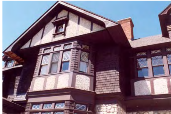
Detail of Wellscroft, showing some of its Tudor Revival details - half-timbering, cross gables, stonework, wood shingles, and large chimneys

The main house at Wellscroft is an extraordinary example of a large Tudor Revival style home with an Arts and Crafts interior. The secondary buildings in the complex, although more utilitarian in nature, were also designed in this manner, making the complex truly homogeneous. The exterior of the main house has most of the main attributes of the Tudor Revival style, including: a moderately to steeply pitched roof dominated by several prominent cross gables; stone, decorative half-timbering, and wood shingles on its facades, narrow diamond-paned windows, and massive chimneys. The interior displays many of hallmarks of an Arts-and-Crafts style interior, including: the widespread use of wood in floors, doors, decorative trim, box beamed ceilings, wainscoting, fireside nooks, window seats, and built-in furnishings.