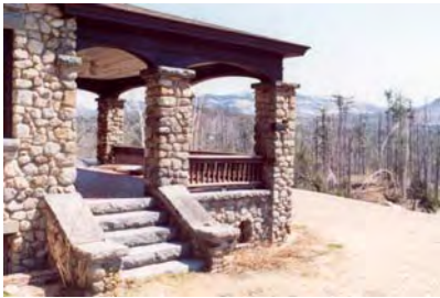
View of front porch at Wellscroft

The most distinguishing feature of the rear of the first floor is the large semi-circular projection, which houses the interior stairway , and the porte-cochere attached to it.