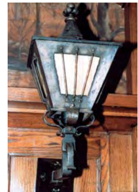
Detail of light fixture in Billiard Room

window seat, which is set within the projecting bay on the rear of the house. The room is naturally lit by the four pairs of diamond-paned casement windows in the window seat and by three other double hung (diamond-paned above, single pane sash below) windows. Of the light fixtures in the room, the hanging lights in the inglenooks and the light over the billiard table are original. The sconces are period replicas. Off of the billiard room and en route to the bar, is a small bathroom. It has plaster walls and ceiling, 4" ceramic tile wainscoting, 1" ceramic tile flooring, an original pedestal sink, and two diamond-paned casement windows. The window, door, and trim are painted.