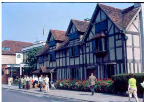
English half-timbered building

The exterior of the second story is finished with either wood shingles or decorative half timbering (wood and stucco) and flares outward where it meets the stone first floor so that it creates a projecting and molded band between the floor levels. Half-timbering is, perhaps, the most common defining feature of Tudor Revival style architecture. It was a characteristic of medieval buildings that were framed with heavy timbers. Historically, the space between the frames was filled with a variety of materials, then surfaced with a plaster or stucco material. In Tudor Revival buildings, both the "beams" and "fill" material are applied to the surface of the building.