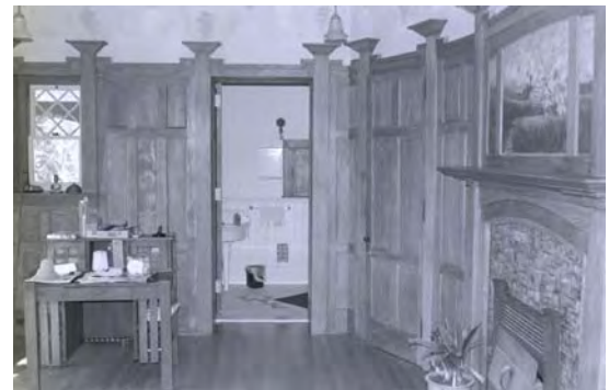
Ladies Tea Room, showing wainscoting, fireplace, wall painting, floors, and typical doors and window

The "Ladies' Tea Room" is a 13' x 17' room, just off of the living room. It has very distinctive 8' high (pickled) oak wainscoting, with a pattern of recessed vertical panels, divided by vertical wood pilasters with flared capitals. Above the wainscoting are plaster walls, on which there is a hand painted pattern of grapes and flowers, and a plaster ceiling. The woodwork also extends to the built-in seat in the bay window, to the interior doors to the closets and bathroom, and to the fireplace surround. The fireplace has a cast-iron (coal) insert, which is surrounded by mottled green ceramic tile. Above the projecting wood mantle are three panels in which a rural scene is painted. The room has 2" wide oak flooring and two storage closets, concealed in the small spaces created by the irregular shape of the room. Adjoining this room is a small bathroom, which has plaster walls and ceiling, wainscoting of 4" ceramic tiles, and 1" ceramic tile flooring.