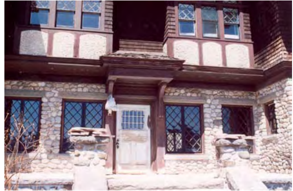
Detail of Main House, showing window, door, and other façade details

The exterior of the main house is punctuated by an assortment of casement, fixed, and double-hung windows. The casement windows are tall and narrow, have diamond-paned sash and occur as single units, in pairs, and as groups of three or more units in the building's bay windows. The double hung-windows, primarily found on the service wing, typically have diamond-paned sash above and a single light below. The diamond-paned sash is another direct reference to medieval building details.