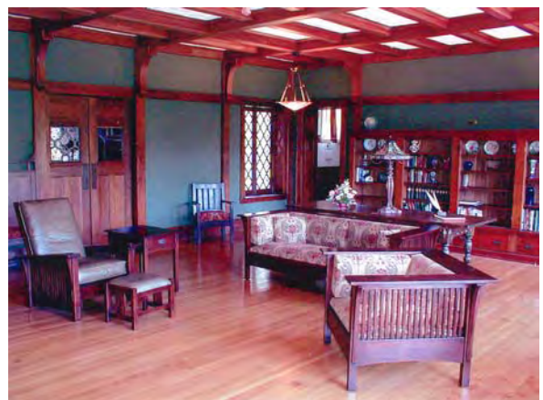
Living Room at Wellscroft, showing many of its Arts and Crafts style features

In the United States, the Arts and Crafts Movement was championed by Gustav Stickley (1848-1942), primarily through the publication of his monthly magazine, The Craftsman (1901 to 1916). The designs for houses, furniture, and decorative objects promoted by Stickley in The Craftsman were guided by the belief, as he wrote in the first issue, “that beauty does not imply elaboration or ornament.” From this emerged two basic principles of design: (1) That structure should be expressed honestly and that structural elements were also decoration, and (2) that natural materials should be used in an honest, unmanipulated way.