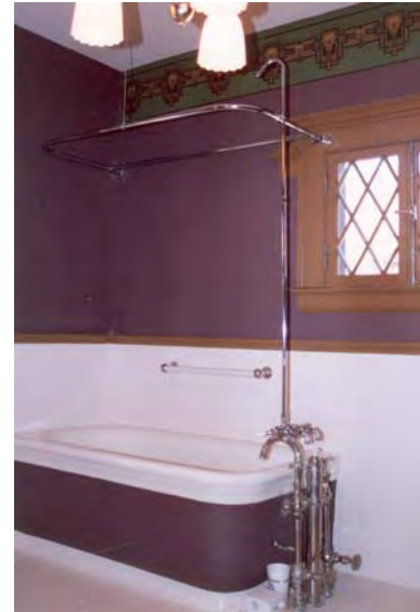
View of Bathroom, showing typical fixtures and interior details