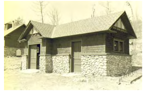
View of Fire House, showing overall form and exterior features

The Fire House is a small (17' x 27' overall) one-story, T-shaped, building with a moderately pitched gabled roof. The lower portion of the building is constructed of native field and cobblestone and the upper portion of the building is wood-framed and faced with wood shingles. The gable portion of the eaves are also shingled. The gables have decorative half-timbering (wood and stucco). The building has several exterior wood doors, which have four (two vertical over two horizontal) panels. The building has an assortment of four pane casement windows.