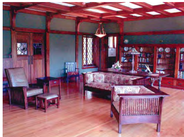
Wellscroft Living Room

The living room is the largest single room in the house, approximately 24' x 30' in size, and it is positioned so as to be the virtual center of the house. When one enters the house through either of the main front or rear entrances, one enters the living room and, off of the living, are the billiard room, dining room, tearoom, stairway to the second floor, and staff wing. The living room has a boxed beam ceiling, with dark stained box beams and textured plaster ceiling panels. The ceiling height (like the rest of the first floor) is 10' 6". The wall surfaces are divided by vertical and horizontal (dark stained) wood bands, between which the walls are surfaced with fabric. Large wood brackets, applied to the vertical bands, "support" the ceiling beams. The living room has 2" oak floors and a large built-in display/storage unit with shelves and drawers.