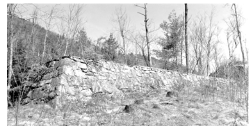
Reservoir at Wellscroft, showing stone walls

The Root Cellar is an underground structure, constructed of native fieldstone. It has a barrel-vaulted ceiling and is accessed via a corridor cut into the embankment, which is supported by two stone retaining walls. It has one wood door.