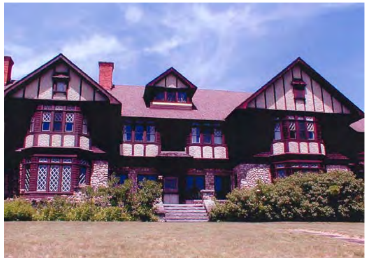
Front façade of Wellscroft, showing many of its Tudor Revival style features, including projecting bays and cross gables, stone, wood shingles, and half-timbering, moderately pitched roofs, narrow casement windows, and large chimneys

The main house is a long, rectangular shaped two-and-one-half story building with several projecting bays and porches, gables and dormers, a porte-cochere, and a service wing. The first story is faced with native fieldstone, which is also used on the house's porches, as roof supports and railing components, on exterior stairs, and in the porte-cochere. Quarried local granite is used for door and window lintels and sills on the first floor, porch and terrace steps, and as capstones on porch piers, railings, and on the porte-cochere's battlements and buttresses. The porches have either patterned slate or flagstone floors. The stonework of the porches and terrace is pierced by arched openings to allow for ventilation. This widespread use of stone is an important attribute of Tudor Revival style architecture and goes back to an embrace of the "medieval" and to the use of materials which were both simple, natural, and "rugged."