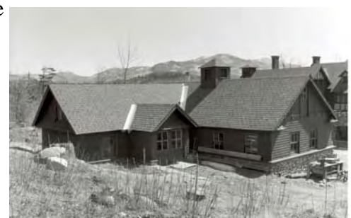
View of Power House, showing overall form and exterior features

The Power House is a (39' x 41' overall) one-story, L-shaped, building with a moderately pitched gabled roof, which is punctuated by a chimney and ventilator cap. The lower portion of the building is constructed of native field and cobblestone and the upper portion of the building is wood-framed and faced with wood shingles. The gable area of the building originally had a decorative half-timbered finish (wood and stucco), which has since been removed (plans are to restore it). The fascia of the gable eaves wood shingled. The building has several exterior wood doors, which have a four-pane light over two vertical or three horizontal panels. The building has an assortment of 2/2 double-hung windows. The Power House is used to house the wood-fired heating system for the main house, for storage and for shop space.