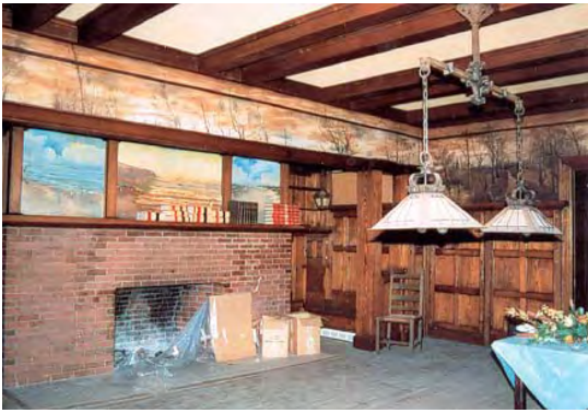
Billiard Room, showing boxed beam ceiling, fireplace, wall murals, built-in features, and original light fixtures.

wainscoting are plaster walls, on which a mural of an outdoor scene is (hand) painted. This painting extends around the entire room. The focal point of the room is a large brick fireplace. The fireplace mass is 11' 6" wide and the fireplace has a 52" x 34" opening and a herringbone pattern hearth. Above the fireplace mantle, in three panels, is a hand painted ocean scene. The murals were done by Lake Placid artist Averil Conwell. The billiard room also has several distinctive built-in features. On either side of the fireplace are inglenooks or built-in benches and within the nooks are built-in cupboards. Opposite the fireplace is a large (13' 6' wide and 2' deep)