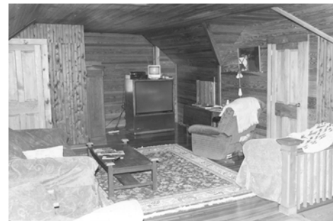
View of third floor area, showing typical interior finishes

From the second floor hallway there is a set of stairs to the third floor. The third floor consists of a large common room, three bedrooms, a bathroom, a large storage area, and a central hall connecting these rooms. Except for the south bedroom, all these spaces share some common features. They have fir floors and clear finished edge and center bead (wainscoting) material horizontally applied to all wall and ceiling surfaces. They have four panel doors and an assortment of diamond-paned casement windows in the gables and dormers that provide light and space for this floor level. The south bedroom also has fir flooring but has plaster walls and ceilings and painted baseboard, door, and window trim. The third floor is also served by the service elevator and, from the third floor, there is access to another large storage area above the service wing. Except for the creation of a new bathroom on this floor level, all space configurations are original, all wall, ceiling, and floor materials and finishes are original, and all or almost all doors, windows, and hardware are as original.