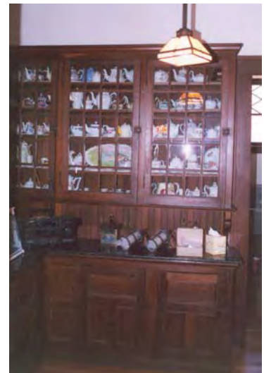
Detail of the Serving Pantry, showing typical built-in cabinet