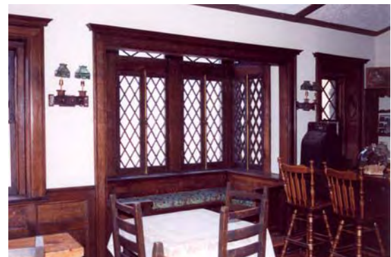
View of Barroom, showing wainscoting, window seat, and bay window.

It has 2" oak floors, (40" high) paneled oak wainscoting, plaster walls above the wainscoting, and a shallow arched plaster ceiling. Like the Ladies' Tea Room and Billiard Room, its central features are a fireplace and bay window, opposite one another. The fireplace is made of a gray brick, is 8' x 5' overall, has a 3' x 2 1/2' opening, steel insert, herringbone pattern red brick hearth, and is capped by a simple wood mantle. On either side of the fireplace are built-in cupboard units, each with a shelf unit above with clear and stained glass doors and drawers below. The window seat is 12' wide and is lit by five pairs of diamond-paned casement windows and five fixed diamond-paned windows. The room is also lit by three other double-hung windows, diamond-paned above and single light sash below. A paneled oak exterior door leads to the front porch. Of more recent vintage in the room is its bar and liquor storage unit.