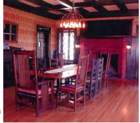
Wellscroft Living Room, showing boxed beam ceiling, fireplace, floors, and typical windows and doors.

The dining room is a large 23' x 23' room. Like the living room, it has 2" oak flooring and a boxed beam ceiling, between which are flat plaster ceiling panels. The walls have 49" high wainscoting, with a repeating pattern of three horizontal recessed panels. The beamed ceiling, wainscoting, doors, windows and trim are all stained a dark green. Above the wainscoting are plaster walls, finished with wallpaper. The most distinguishing feature of the room is its large (48" x 36") opening brick fireplace. It is slightly recessed into the outside wall surface and is covered by a decorative hood, all of which create the feeling of an 18 th century kitchen hearth. The room also has a built-in china/linen cupboard and two "breakfast nooks." The room's original lighting, a central chandelier and 6 wall sconces, was stolen during the period when Wellscroft was abandoned but has been replaced with appropriate replica fixtures. Outside light is provided primarily by large bay window with five diamond-paned casement windows. Off of the kitchen is a serving pantry, to be described later as part of the service wing.